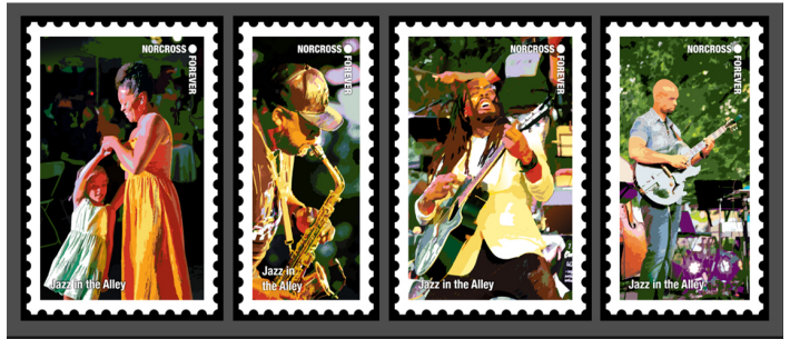
Jazz in the Alley