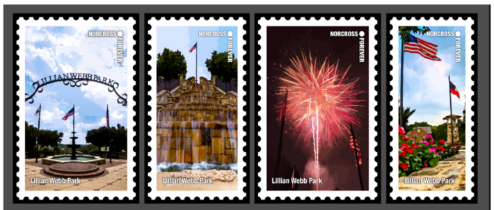
Lillian Webb Park