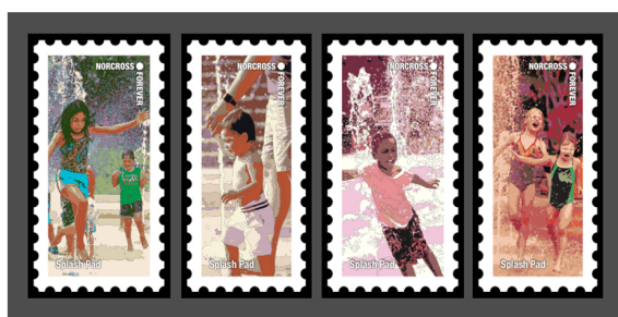
Splash Pad Fun