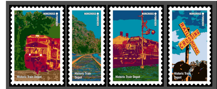
Historic Train Depot