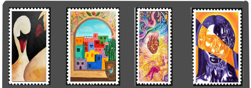
Norcross High School Art