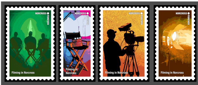
Filming in Norcross